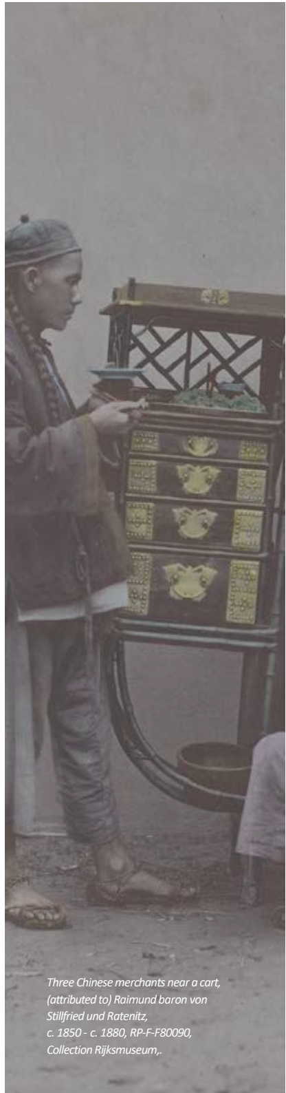
Three Chinese merchants near a cart, (attributed to) Raimund baron von Stillfried und Ratenitz, c. 1850 - c. 1880, RP-F-F80090, Collection Rijksmuseum,.

If you live quite far from the location where the course meetings are held, please inquire at the Posthumus Institute about the possibility of receiving some reimbursement for your travel costs.