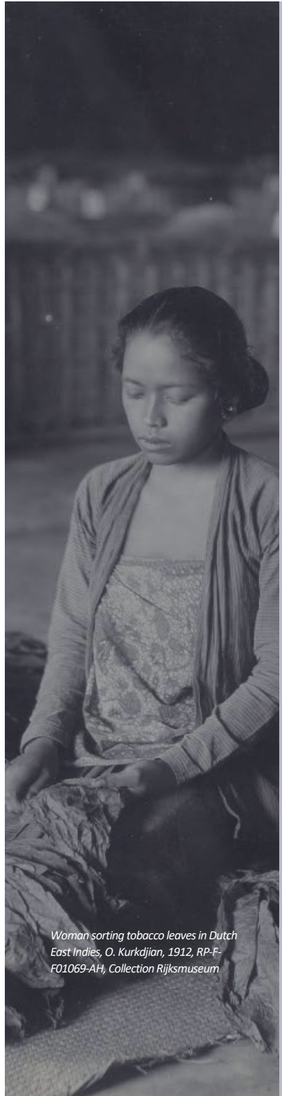
Woman sorting tobacco leaves in Dutch East Indies, O. Kurkdjian, 1912, RP-F-F01069-AH, Collection Rijksmuseum

Students are also invited to visit the annual Posthumus Conference, which takes place every year in May or June. They may sign up as a discussant for a paper at the conference.