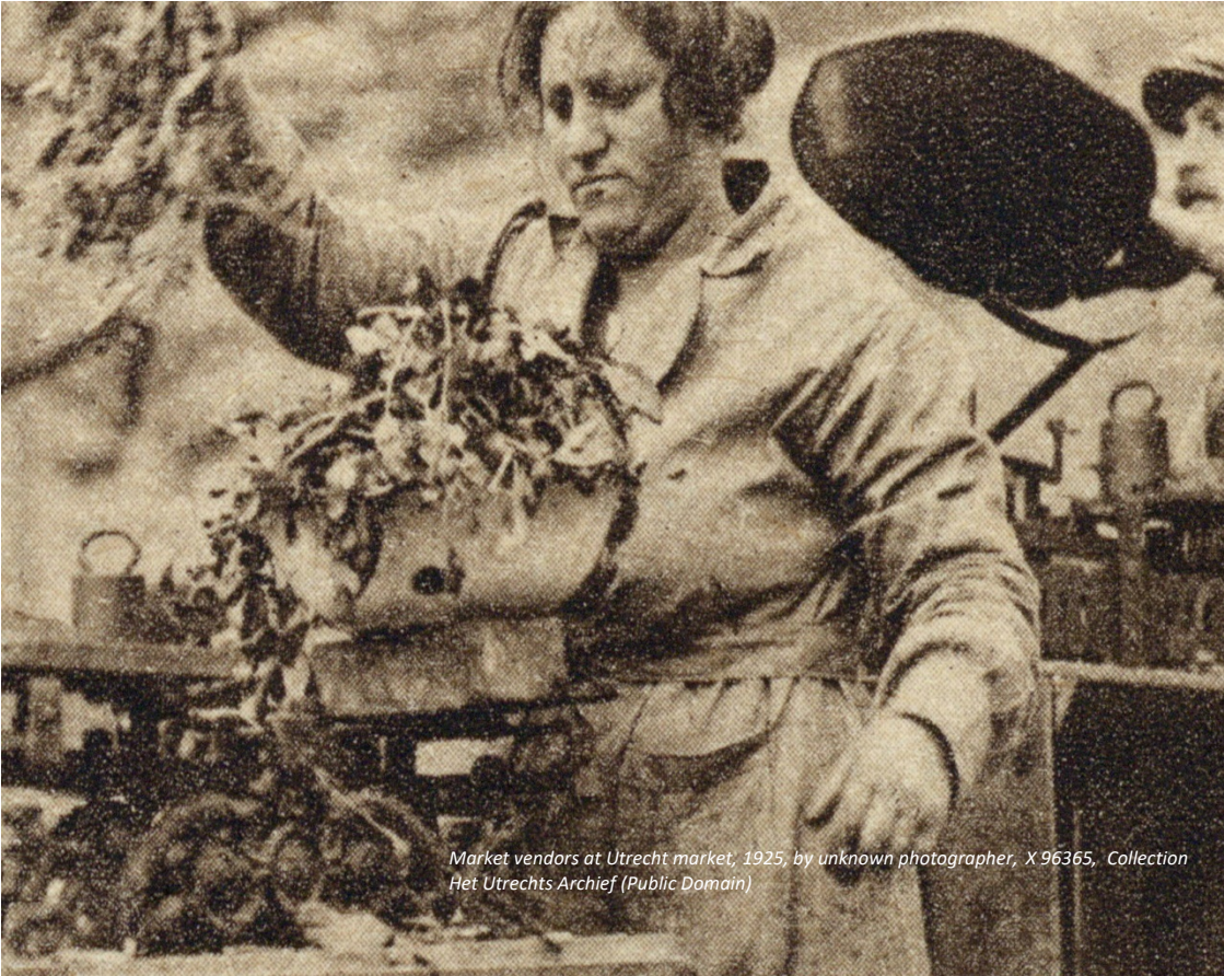
Market vendors at Utrecht market, 1925, by unknown photographer, X 96365, Collection Het Utrechts Archief (Public Domain)

"The Posthumus courses are a great opportunity to meet other talented students and learn from the best scholars in economic and social history. The broad topics enable you to make most of your own research." (Gijs Dreijer, Leiden University)