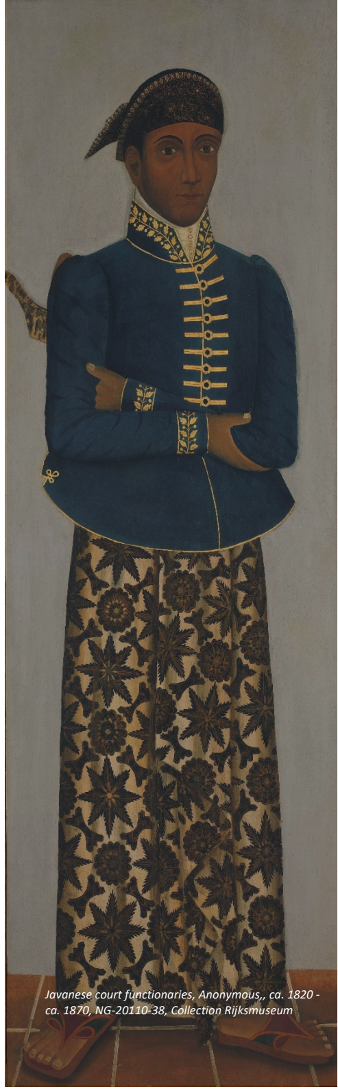
Javanese court functionaries, Anonymous, ca. 1820 - ca. 1870, NG-20110-38

In addition, the course emphasizes transparent management by using platforms like GitHub and GRLC to share data management scripts.