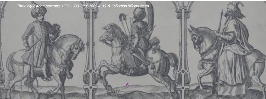
Three equestrian portraits, 1596-1630, RP-P-1885-A-9618